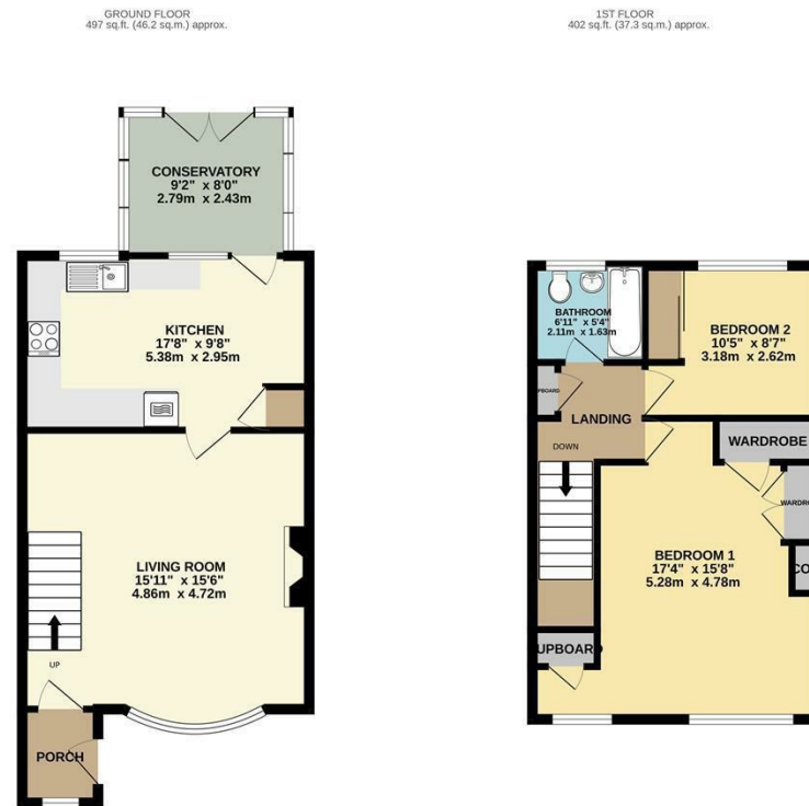
ROSE BAY COTTAGE, EAST HARLSEY, NORTHALLERTON, DL6 2BL

TOTAL FLOOR AREA: 899 sq.ft. (83.5 sq.m.) approx. Whilst every attempt has been made to ensure the accuracy of the floorplan, measurements of doors, windows, rooms and any other items are approximate and no responsibility is taken for any error, omission or mis-statement. This plan is for illustrative purposes only and should be used as a guide only by any prospective purchaser. The services, systems and appliances shown have not been tested and no guarantee as to their operation or efficiency can be given. Made with Neotoma 12/2018