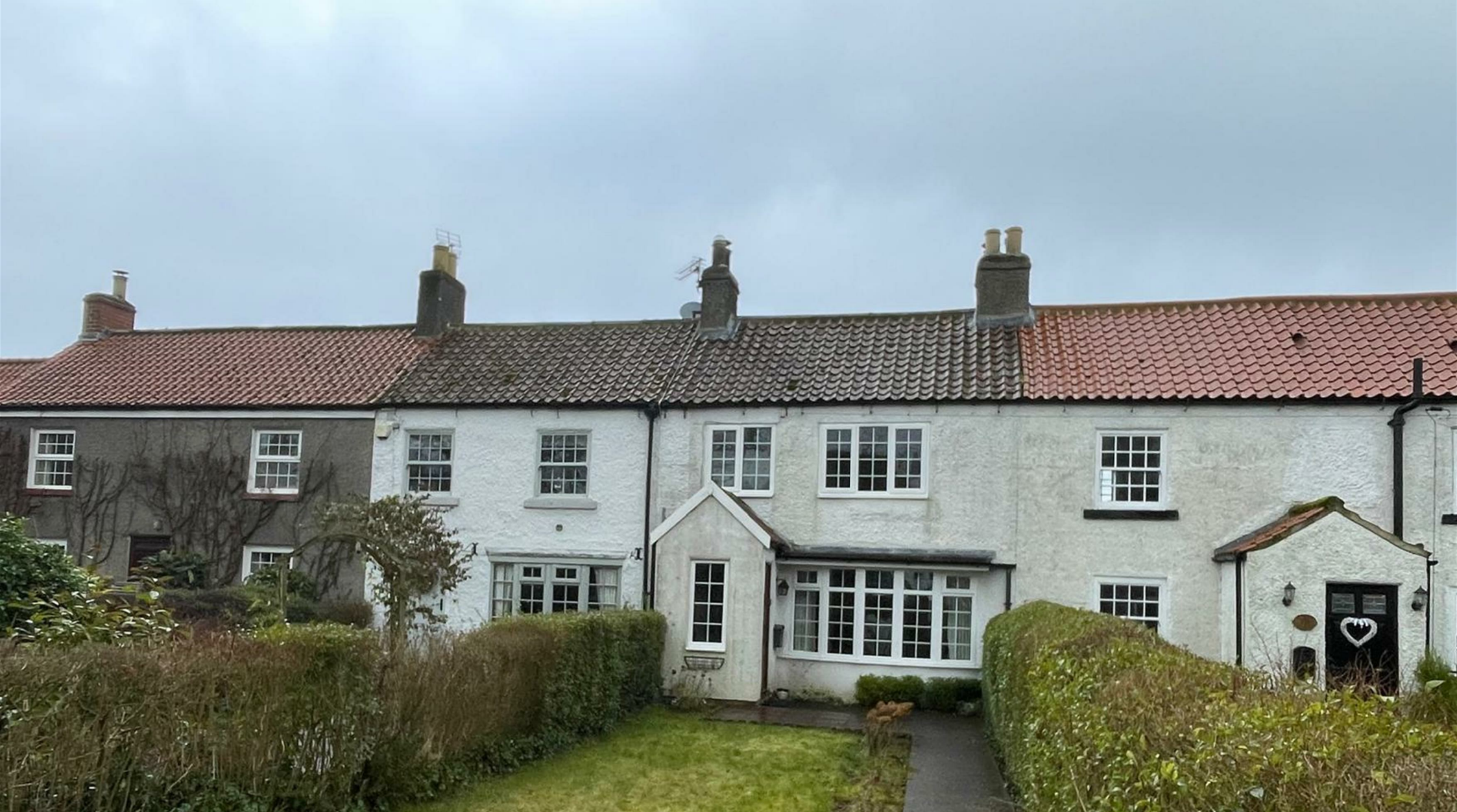
ROSEBAY COTTAGE, EAST HARLSEY, NORTHALLERTON £225,000